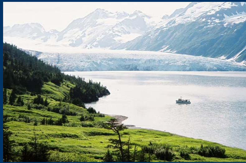
Prince William Sound in Alaska