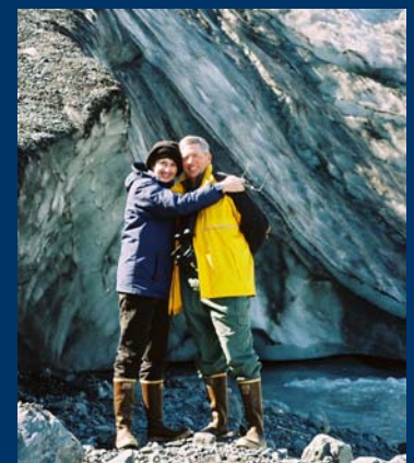
Glacier Hiking in Alaska